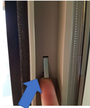
Pull take out clip out from jamb at bottom of clip (both sides)