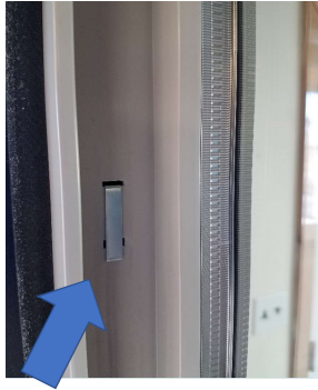
Locate take out clip in the side jamb of the window**