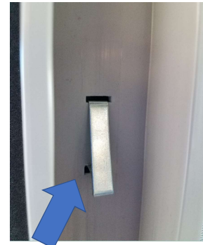
Take out clip view after pulling out from jamb