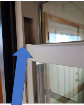
Unlock window and raise sash up past take out clips