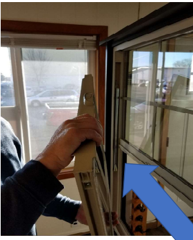
Swing the gap side of the window out and remove the sash