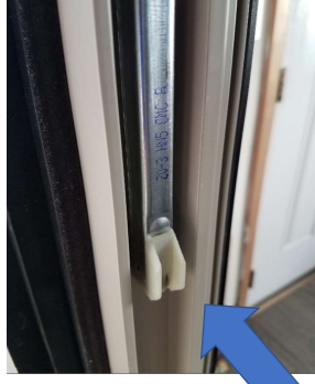
When replacing the sash, be sure to set the sash above the balance shoe